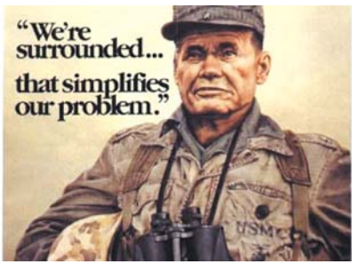
General Lewis B. "Chesty" Puller